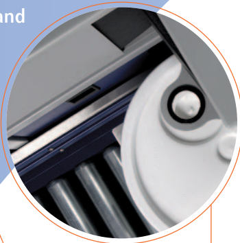
Bombsight alignment tool