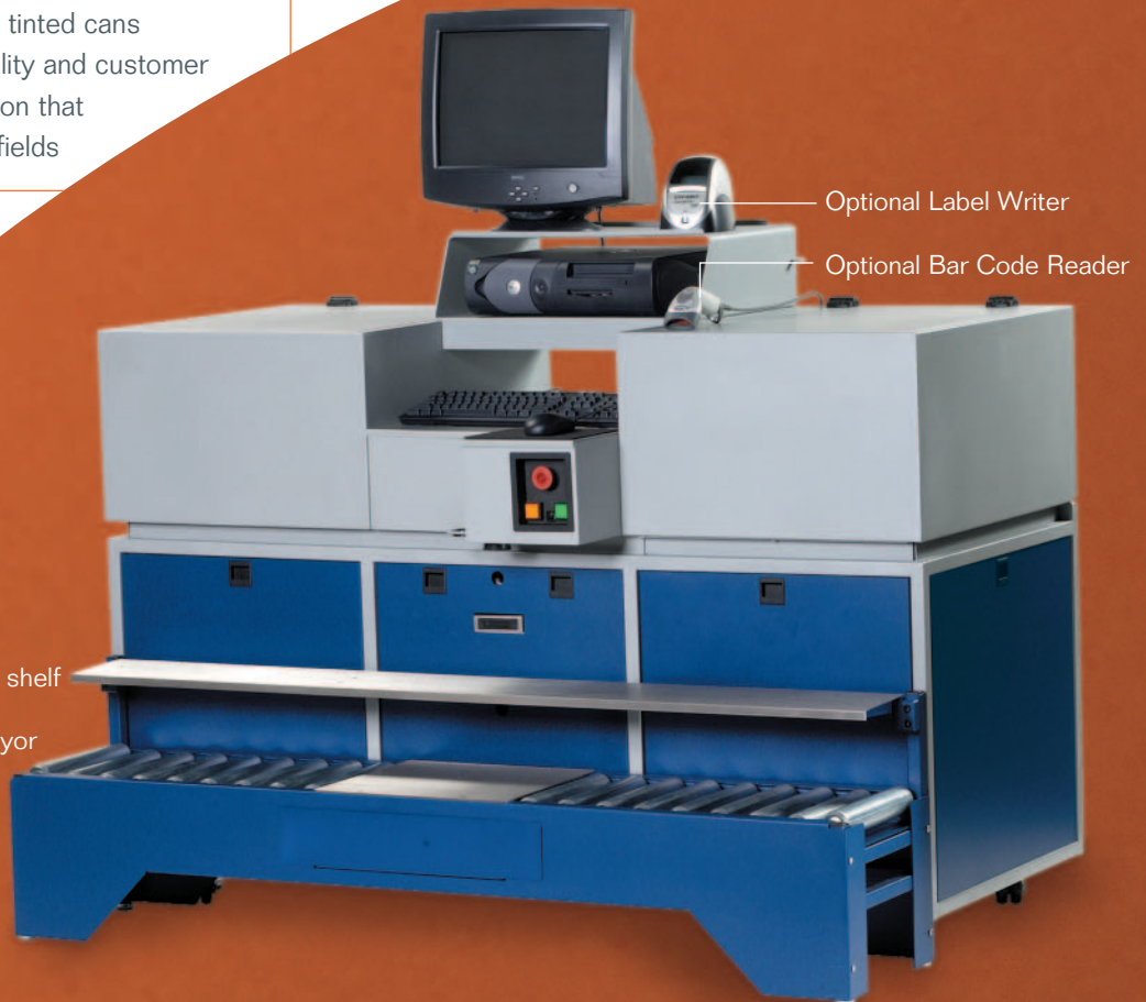
5-gallon roll conveyor