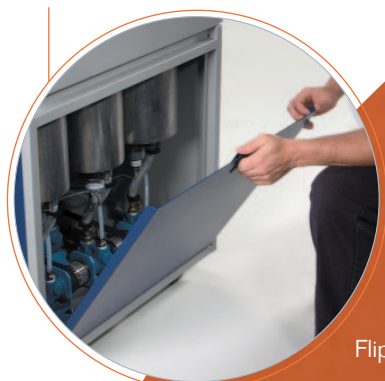
Flip-down 1-gallon shelf