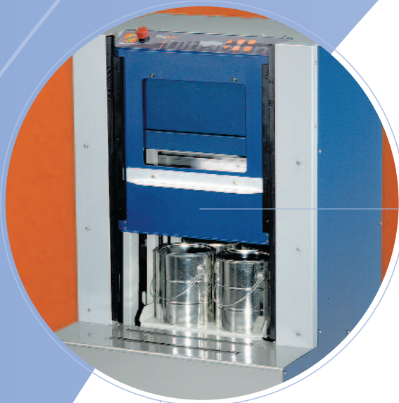
Sturdy sliding door